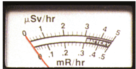
Optional SI Meter Scale: 0-500 µSv/hr & 0-50 mR/hr