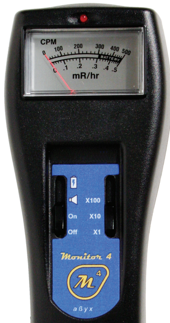
M4 with CPM & mR/hr meter scale

Analog Meter holds full scale in fields as high as 100X maximum reading. CPM & mR/hr scale. Optional SI Scale Meter Available