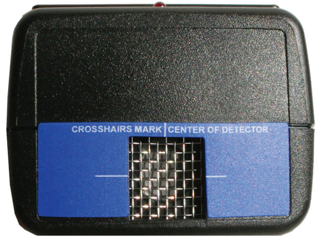
The end window of the M4

Dual miniature jack drives CMOS or TTL devices: count to computer or datalogger. Submini jack input allows for electronic calibration. USB versions of the M4 and M4EC have a mini-USB jack for use with the USB Observer Software.