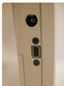
DC and USB connection