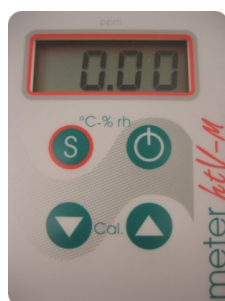
Easy to use, 4-button interface