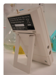
Built in Stand