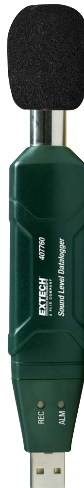
USB connector plugs into PC for quick downloading of Sound Level data to be analyzed using the software included

Distribuito da: Zetalab s.r.l. Zetalab.it