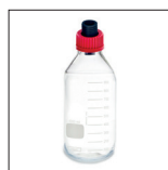
A00000419 Kit plastic biodegradability analysis