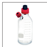
A00000410 Denitrification glass bottle