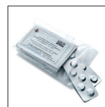
A00000136 Control Test tablets