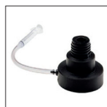
A00000135 Sensor check