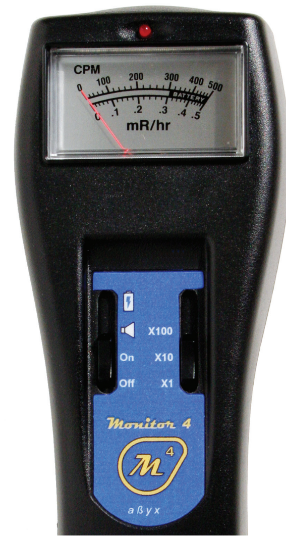
M4 with CPM & mR/hr meter scale

Analog Meter holds full scale in fields as high as 100X maximum reading. CPM & mR/hr scale. Optional SI Scale Meter Available