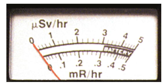
Optional SI Meter Scale: 0-500 µS/hr & 0-50 mR/hr