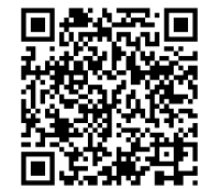
6556 WeatherLink iPhone App