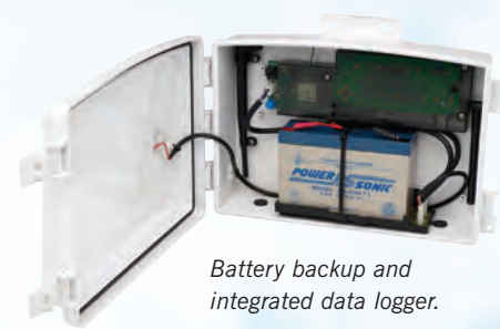
Battery backup and integrated data logger.

Available in both wireless and cabled versions, Vantage Connect can either take the place of your console or work with your console to send weather data directly to the “cloud” using mobile technology. The wireless version of Vantage Connect is radio-compatible with Vantage Pro2 and Vantage Vue transmitters and repeaters for easy integration as a new remote station or into an existing weather station.