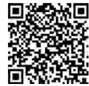
6557 WeatherLink Android App