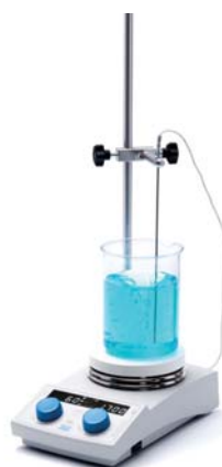
AREX-6 Digital with Probe, Rod and Clamp