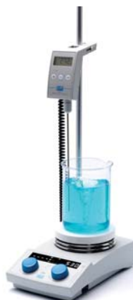
AREX-6 Digital PRO with VTF and Rod