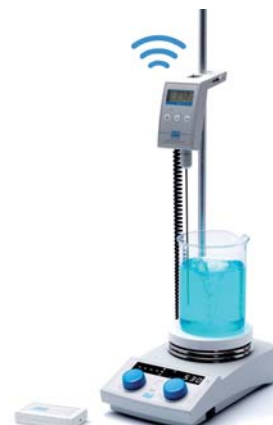
AREX-6 Digital PRO with VTF EVO, Rod and Wireless DataBox™