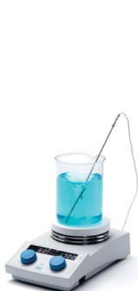
AREX-6 Digital with Probe