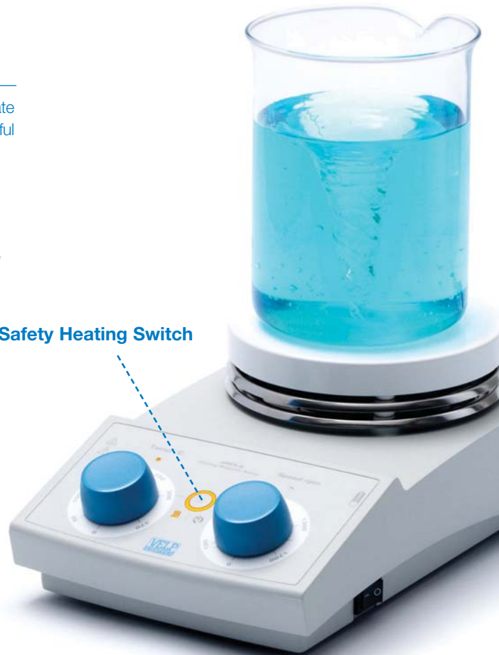
AREX-6 With VTF EVO, Rod and Wireless DataBox™