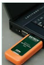
BRD10 - Optional Wireless USB Video Receiver allows user to stream live video to a PC and also can be remotely viewed via VOIP connection