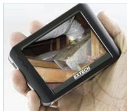
Detachable wireless 3.5" color TFT LCD display can be viewed from a remote location up to 32ft (10m) from the measurement point.

Complete with 4 AA batteries, rechargeable display battery, microSD memory card with SD adaptor, USB cable, extension tools (mirror, hook, magnet), video interconnect cable, AC adaptor (100-240V, 50/60Hz), magnetic base stand, and hard case